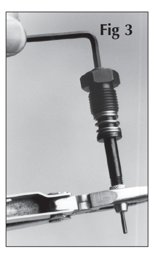
Fig 3. To remove the decap pin, use a 1/8" Allen wrench to hold the decap stem while loosening the retaining cap with a pair of pliers. Use a small amount of 242 (blue) Loctite and tighten securely on reassembly.

and at no extra charge. Fig 2 also shows the three main pieces of the decapping stem: A. Decapping shaft. B. Retaining cap. C. Decapping pin.