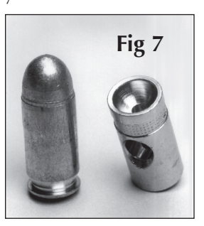
Fig 7 is the round nose seating stem and Fig 8 is the semi-wadcutter seating stem. When the desired configuration is found push the stem back into the insert and replace the cross

pin. Reinsert the seating insert into the die body. Replace the clip and proceed.