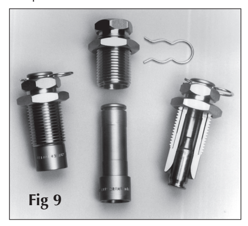
Fig 9. Crimp die assembly. On the left the completed assembly is shown before screwing it into the toolhead.

If your case is not crimped enough, place the cartridge back into the shellplate and repeat your adjustments in 1/8 turn increments until you achieve the proper crimp.