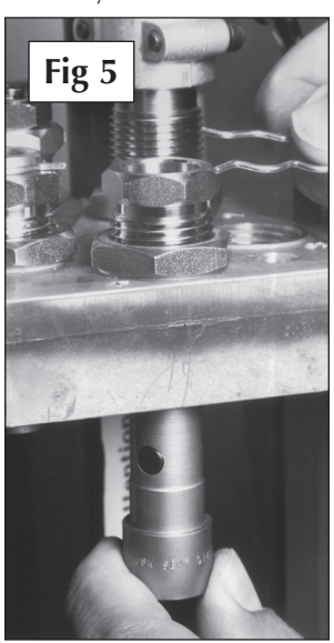
Fig 5. The seating die can be disassembled by simply removing the snap ring at the top and pulling the seat die insert out of the bottom of the seat die body. This allows you to take the die apart for cleaning without tools and without disturbing your seating adjustment.