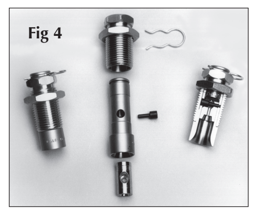
Fig 4. Your Dillon Dynamic seating die is a snap-together assembly.

Fig 5. The seating die can be disassembled by simply removing the snap ring at the top and pulling the seat die insert out of the bottom of the seat die body. This allows you to take the die apart for cleaning without tools and without disturbing your seating adjustment.